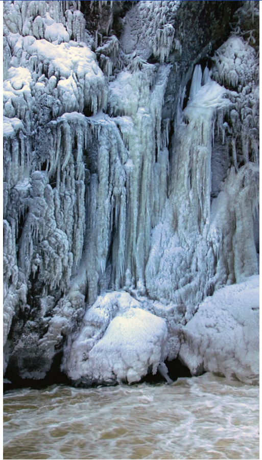
Sophie Whettnall, Waterfall (2008), video still

Like a person who smiles and freezes for the camera, turning herself into an image in advance of the camera's click, the waterfall's movement is literally frozen, transformed into a still image, a kind of photograph in three-dimensions. But this is a video, a moving image, and the river that flows in the foreground might be seen as analogous to the endless flow of motion that video facilitates.