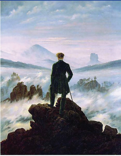
Caspar David Friedrich, Wanderer Above the Sea of Fog (1817), oil on canvas, Kunsthalle Hamburg