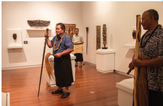
THIS PAGE | Top: Installation of new building signage, September 1, 2017. Lower left: Patrons filled the galleries to experience the reimagined Museum. Lower right: Objects in the Arts of the Pacific gallery receive a blessing from elders in the local Pacific Island community.