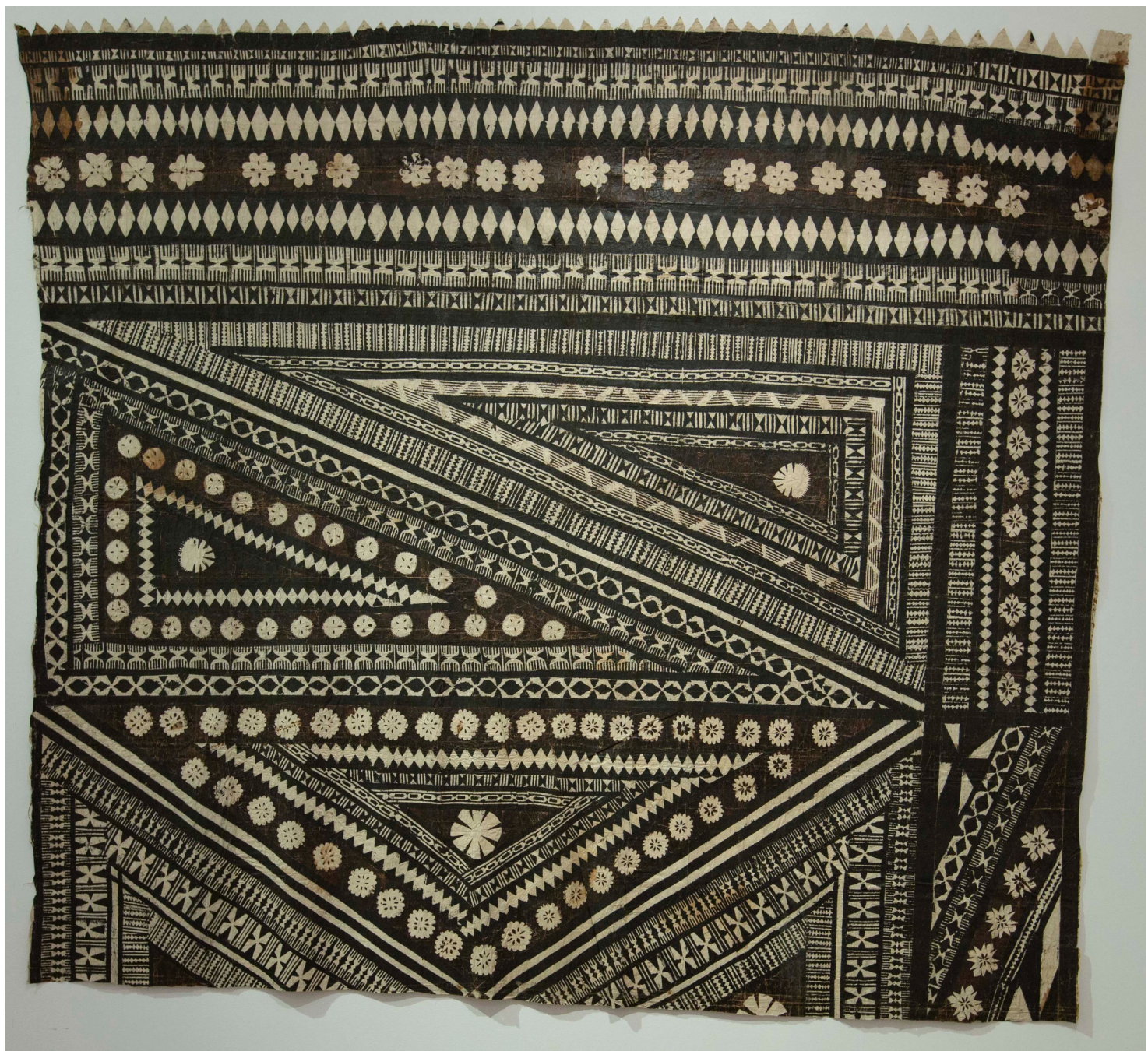
Unidentified artist, Fiji, Barkcloth (Masi) fragment , late 19 th or early 20 th century. Barkcloth, pigment, and resin. Gift of Peacock Revocable Trust. UMFA2005.1.31