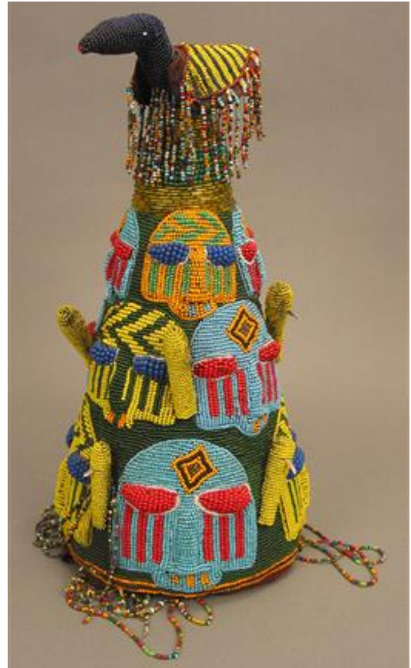
King's Hat , Yoruba, mid-20 th century, cloth, basketry, glass beads, UMFA2008.32.31

The faces on this artwork represent ancestors, and the bird on the top represents a connection to the heavens. This artwork was worn by a king and is therefore called "King's Hat."