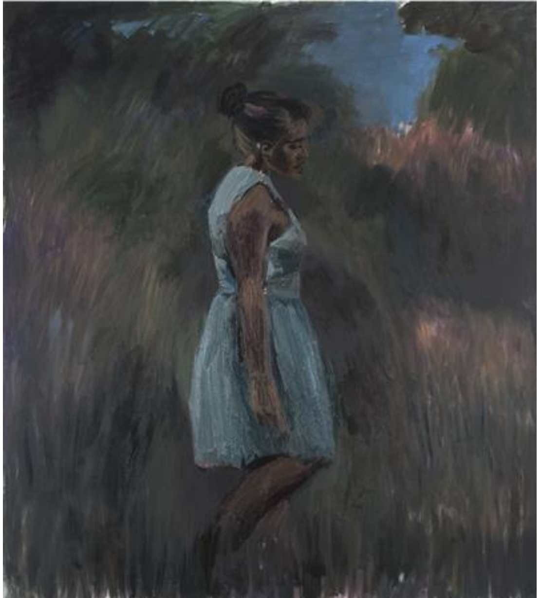
Lynette Yiadom-Boakye, Periphery , 2013. oil on canvas, UMFA2013.3.1

Have you ever been in the same mood as this person? How did you feel?