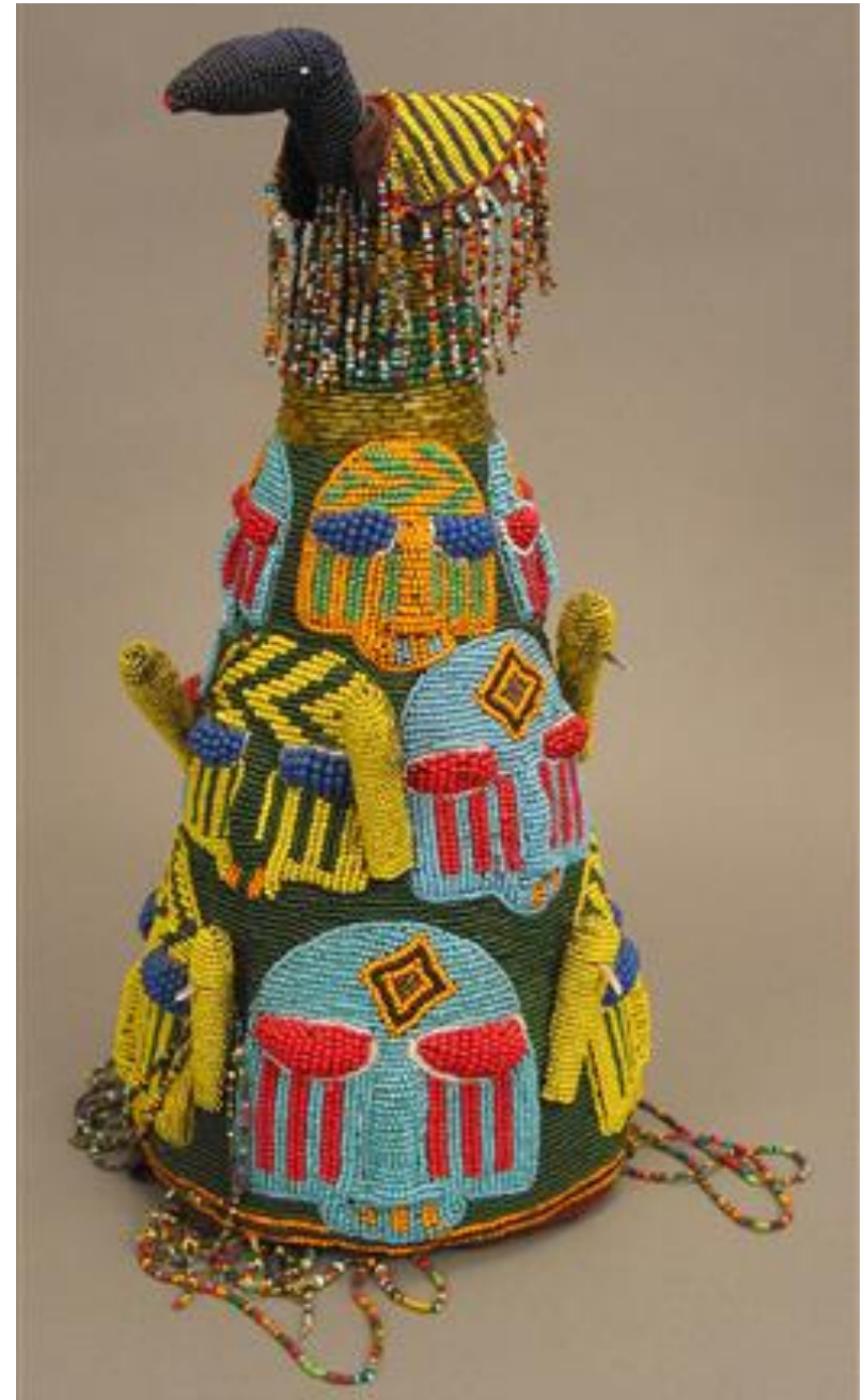
King's Hat , Yoruba, mid-20 th century, cloth, basketry, glass beads, UMFA2008.32.31

The faces on this artwork represent ancestors, and the bird on the top represents a connection to the heavens. This artwork was worn by a king and is therefore called "King's Hat."