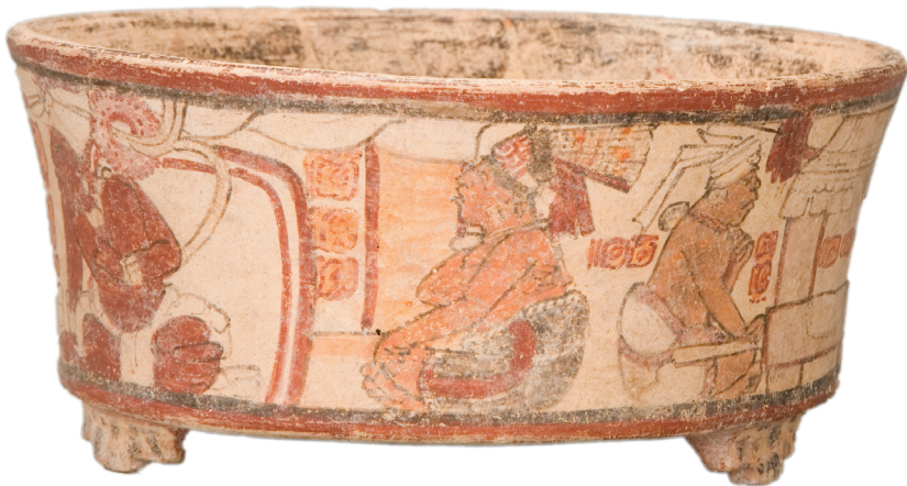
Vessel with Political Scene , Guatemala, Petén region, Maya culture, 600–900 A.D, earthenware and pigment. Purchased with funds from Friends of the Art Museum, UMFA1984.002

To prepare, please complete the following creativity warm-up: