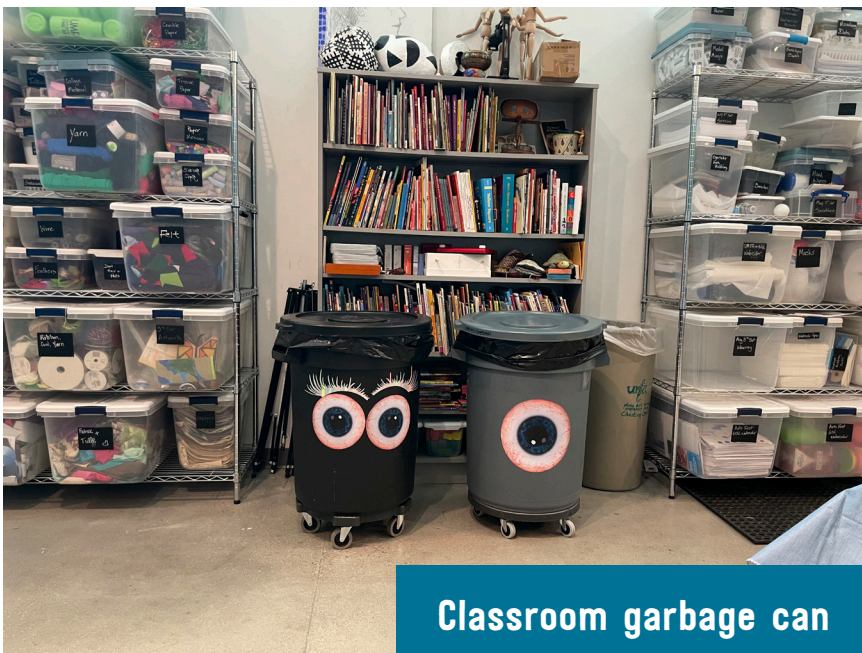
Classroom garbage can

If I need to use the bathroom, I can find them with my chaperone around the Museum.