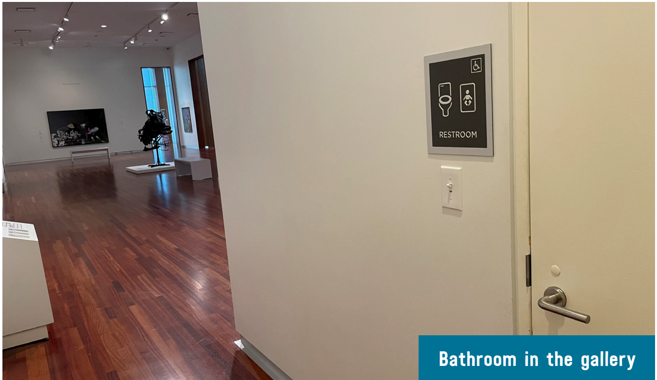
Bathroom in the gallery

There are elevators on both floors, and there is also a big staircase. The docent will let us know if we are taking the elevators or the stairs.