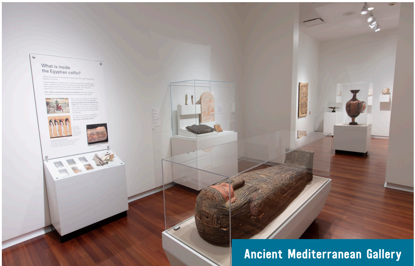
Ancient Mediterranean Gallery