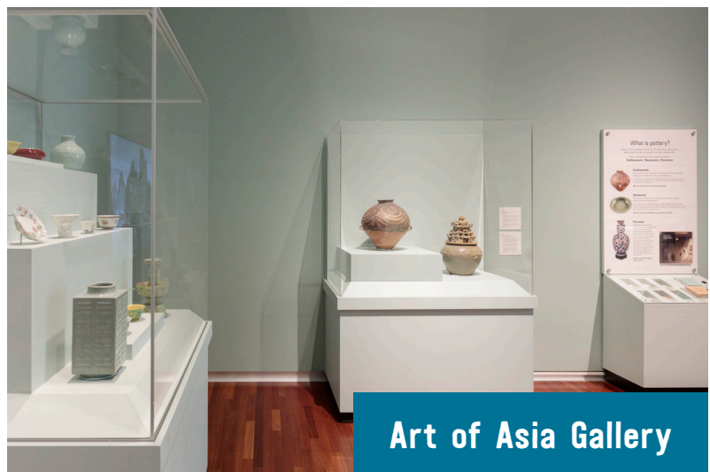
Art of Asia Gallery

This is the Art of Asia gallery. I will look at the kiosk in this room to learn about Chinese pottery. There is a button I can push that shines light through a porcelain tile to see the fine pottery.