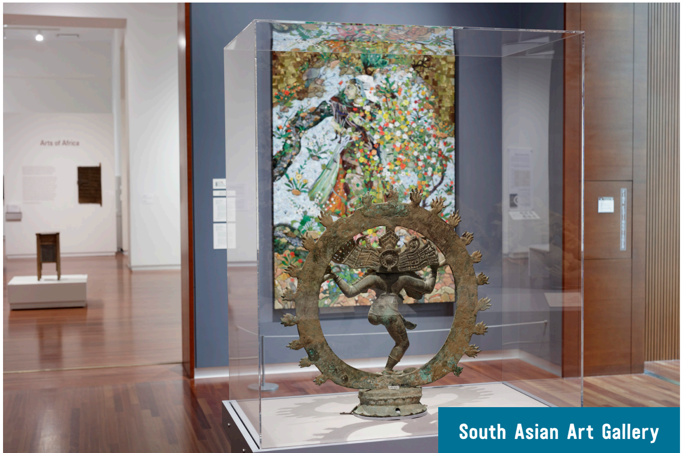
South Asian Art Gallery

This is the South Asian Art Gallery . I can learn about Hinduism and Buddhism through the art in this gallery.