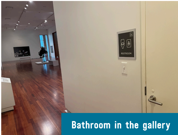
Bathroom in the gallery

If I need to use the bathroom, I will find them on both levels on the map. The easiest bathroom to find is by the Museum Café. I will also find water fountains near each of the bathrooms. There are single-person bathrooms in the galleries on each floor as well. I can ask staff for help to find restrooms and water fountains.