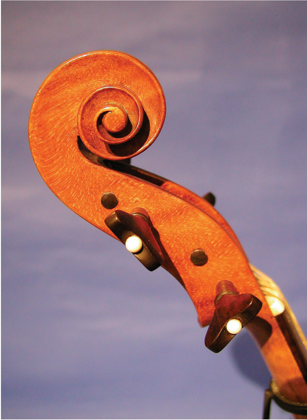
Finial scroll of a viol